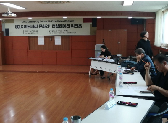
Figures 3 and 4. Culture 21 PLUS workshop in Jinju, July 6, 2023