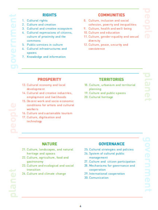
Figure 2. Blocks and areas of Culture 21 PLUS